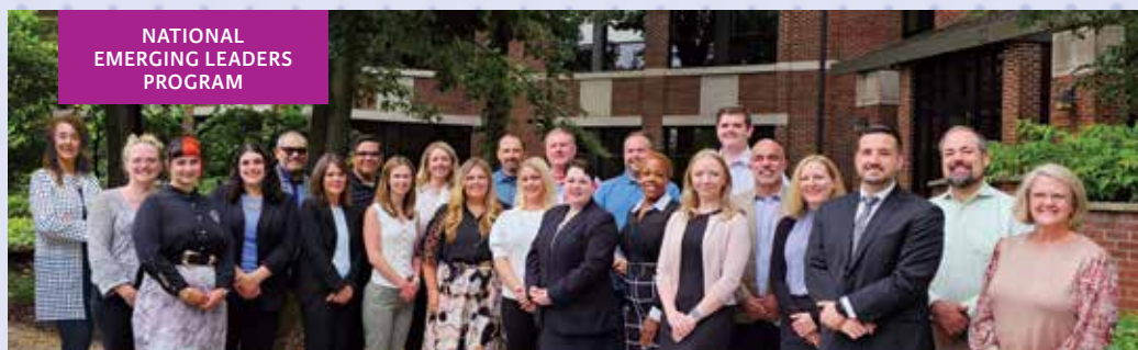
NATIONAL EMERGING LEADERS PROGRAM