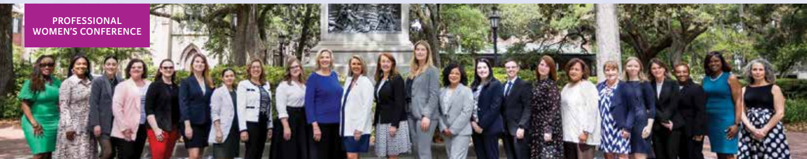
PROFESSIONAL WOMEN'S CONFERENCE

The Foundation supported NFDA's National Emerging Leaders Program, a one-of-a-kind, year-long skills training course for funeral service professionals interested in management, leadership, and more. The 2024-25 class was selected by a national review committee and launched its session at NFDA headquarters in Brookfield, Wisconsin, with a two-day event in June.