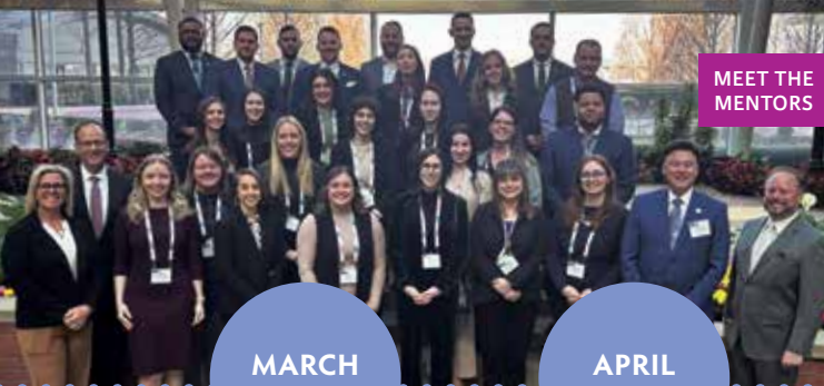
MEET THE MENTORS