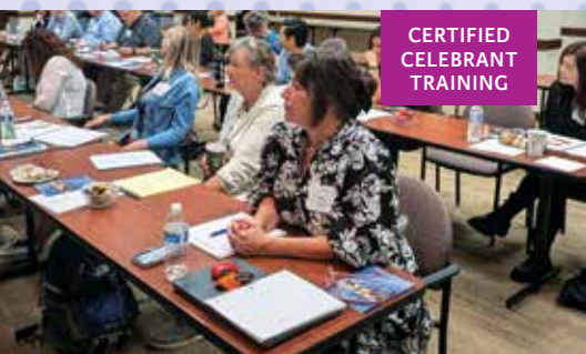
CERTIFIED CELEBRANT TRAINING